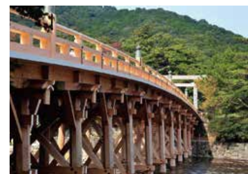
Right: Ise Grand Shrine and Naiku (Inner Shrine)