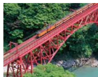
Kurobe Gorge Railway

Day 2 | Unazuki Onsen (hot springs) resort - 🚌 - Mt. Tateyama - 🚶 - Bijodaira - 🚌 - Murodo (spending 180 minutes here, with a Nature Guide to show you round, for an in-depth Murodo experience; for tours departing up until June 20th, visitors can also see the spectacular "Yuki-no-otani" snow wall, which is only open to visitors at certain times of year) - 🚌 - Daikanbo Peak (enjoy spectacular views from the ropeway) - 🚶 - Kurobedaira - 🚶 - Lake Kurobe - 🚶 - Kurobe Dam (for tours departing from July onwards, visitors can enjoy the spectacular water discharges from the dam, which are provided for the benefit of tourists) - 🚌 - Ogisawa - 🚌 - Kitaazumi-gun (overnight)