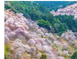
Yoshino "Thousand Cherry Trees"

Hotel: Green Rich Hotel Kyoto Eki Minami or similar