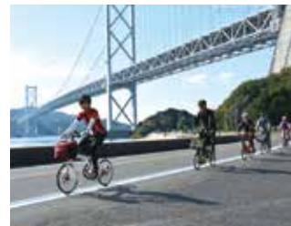
Shimanami Kaido Cycling

The island of Naoshima is located in the beautiful Seto Inland Sea. Historic streets dating from the Edo Period are now adorned with modern art installations, creating magical visual effects; it is as if the whole island had been transformed into an art museum.