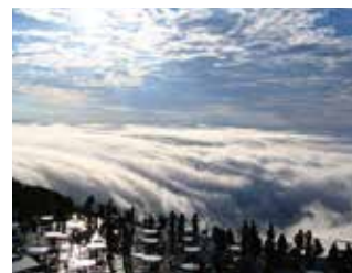
Sea of clouds

🍽️ Meals: Breakfast: ○ Lunch: ✕ Dinner: ✕