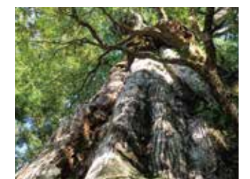
Ancient Yakushima Cedar tree

Hotel: Seaside Hotel Yakushima or similar