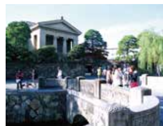
Ohara Museum of Art

Day 5 | Shodoshima Island - 🚌 - Tonosho Harbor - 🚢 - Takamatsu or Uno or Shin-Okayama Harbor - 🚢 - [Celebrate the opening of the Setouchi Triennale 2019! Tour the "art islands" of the Seto Inland Sea on a Club Tourism charter boat!] - 🚢 - Megijima Island - 🚢 - Naoshima Island [Benesse Art Site Naoshima Art House Projects *Includes tickets for all facilities (except Art House Project Kinza); also includes a guided tour of the Chichu Art Museum] - 🚢 - Ikeda Harbor on Shodoshima Island - 🚌 - Olive Park - 🚌 - Shodoshima Island (overnight)