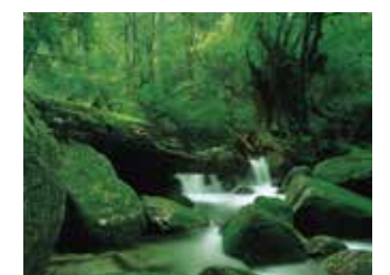
Shiratani Unsui Gorge

Hotel: Seaside Hotel Yakushima or similar