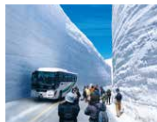
"Yuki-no-otani" Snow Wall

* The hotel will have a large communal Onsen (hot springs) bath.