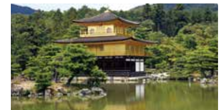
Top: Kinkakuji Temple Bottom: Takayama