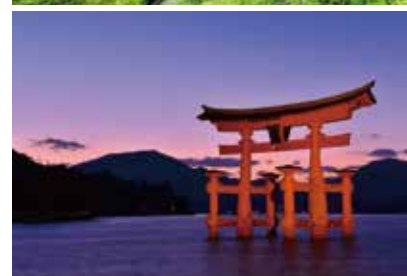
Top: Mt. Fuji Middle: Kiyomizu Temple Bottom: Miyajima