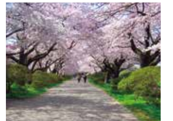
Kitakami Tenshochi Park

🏨 Hotel: Hachimantai Mountain Hotel & Spa