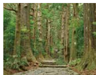
Kumano Kodo pilgrimage route