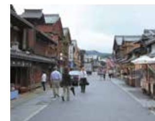
Okage Yokocho in Ise

🍽️ Meals: Breakfast: ○ Lunch: ○ Dinner: ✕