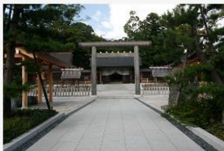
Motoise Kono Shrine