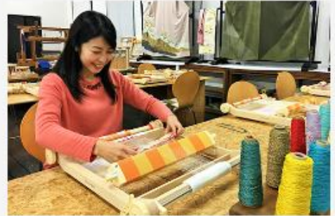
Traditional weaving workshop