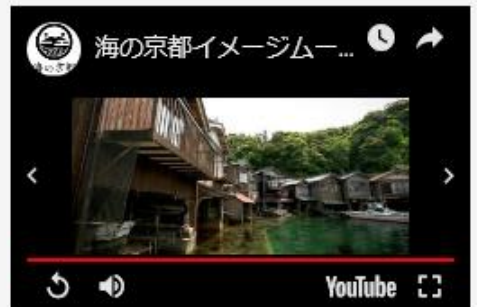
Kyoto by the sea (YouTube)