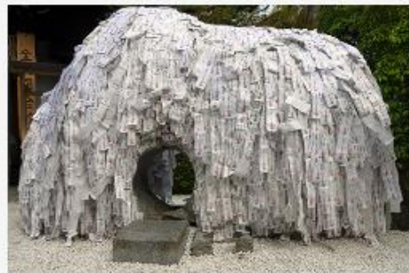
Yasui Konpira Shrine

Motoise Kono Shrine is an ancient shrine with close ties to the famous Ise Grand Shrine in Mie Prefecture. It is said that the goddess of agriculture, Toyouke-Omikami, who once resided in this area and was worshipped at this shrine, was called to Grand Ise Shrine by the sun goddess, Amaterasu-Omikami. She has been enshrined at Grand Ise Shrine ever since.