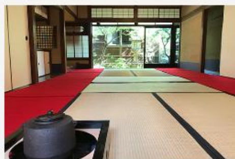
Machiya Town House