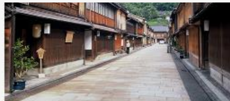
Nagamachi Samurai District

Kanazawa's modern Kutani porcelain is based on a revival of Kutani porcelain dating back to early in the 19th century. Initially, Kutani porcelain was made in Kutani Village in the southern part of Ishikawa Prefecture for several decades beginning in the middle of the 17th century.