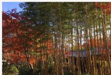
Shokado Garden Art Museum