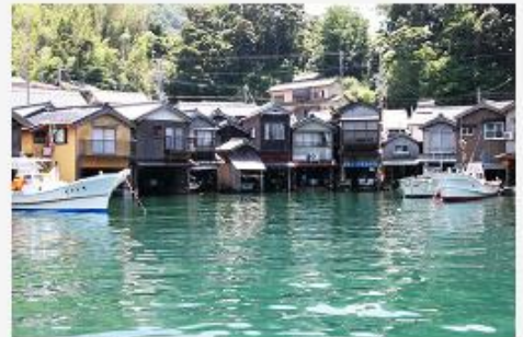
Funaya (fisherman's boat houses)

Eihei-ji Temple, located 16 km southeast of Fukui City in the center of the prefecture, is the headquarters of the Soto sect of Zen Buddhism, with 15,000 branch temples nationwide. The temple was originally built by the Buddhist monk Dogen in the 13th century.